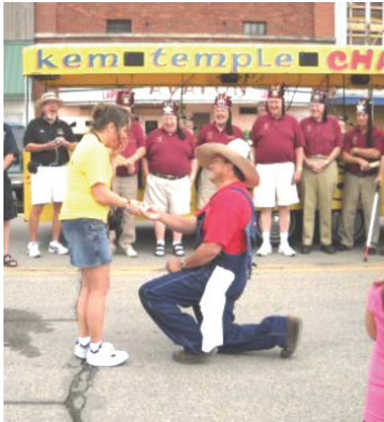
Thanks Chanters with your help she said yes.