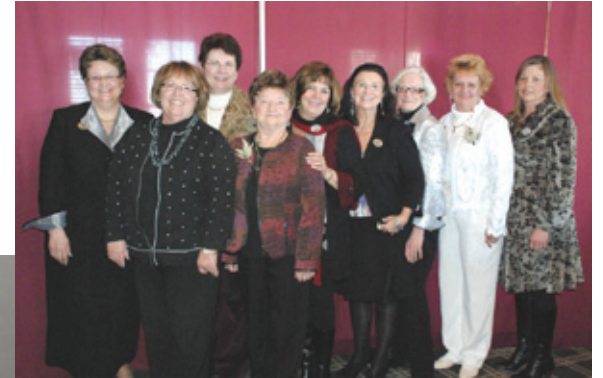
Pictured to the right are the Past Potentates Ladies in attendance who were honored. →